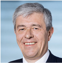
Karl J. Friston

The Wellcome Trust Centre for Neuroimaging Institute of Neurology, London, UK